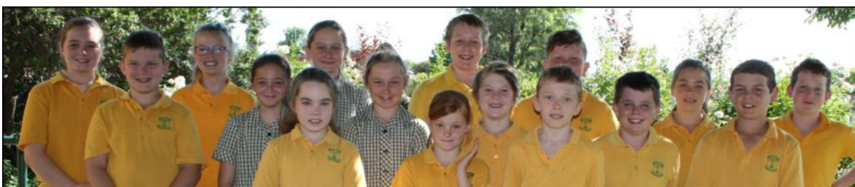
2017 Minister candidates