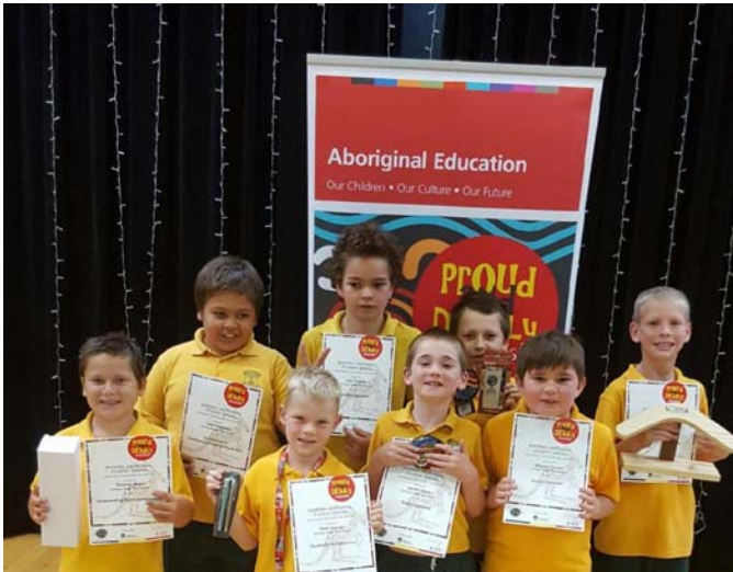
2016 Proud & Deadly Award Winners